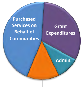
Services to Our Communities